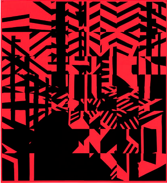
Carl Fudge, Plate Layers 1, 2010. Unique screenprint collage on mulberry paper, 58-1/4 x 59 inches.