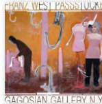
Franz West: Paßstück