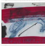
The Last Roar of Leon Golub